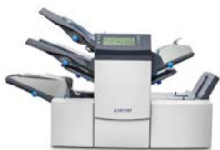
Inserting machine SI 3350