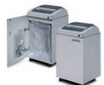
Shredder KOBRA 260 TS