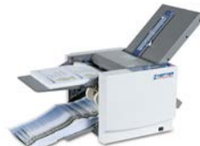
Folding machine TF Mega-S