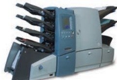
Inserting system SI 4400