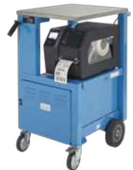
Powered Mobile Print Cart