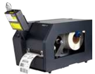
Online Data Validator (ODV)